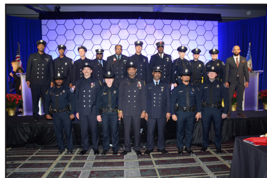
The 10th Annual Above & Beyond Awards Ceremony recognized a total of 37 first responders with DPD and DFD for their distinguished service.