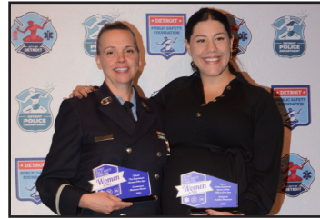
Women In Blue May 18, 2023 MGM Grand Detroit