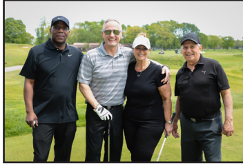
DPD Golf Outing May 15, 2023 Detroit Golf Club