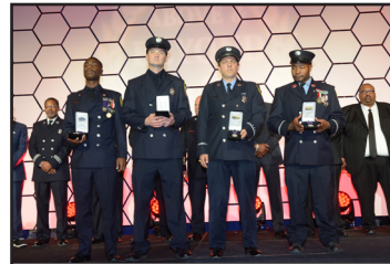
Above & Beyond November 1, 2023 Detroit Marriott Renaissance Center